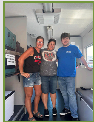
Left and Middle: Our team collected donations and filled Community Food Trucks across Miami County. Right: We served hundreds of meals with The Salvation Army in Piqua, Ohio.