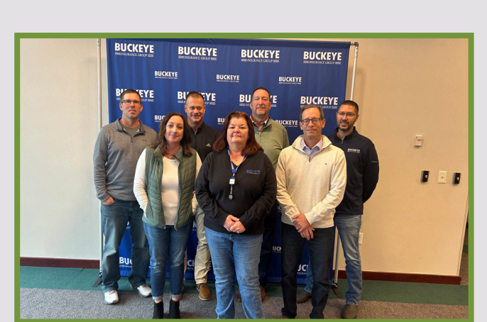
Congratulations to our team members who celebrated milestone service anniversaries!