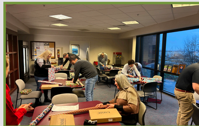
We were grateful to be able to provide Christmas gifts for a Piqua, Ohio family.