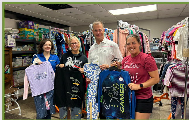
Thank you to our staff for their donations for Seeds of Hope OH in Troy, Ohio!